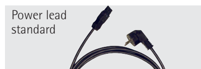
Power lead standard